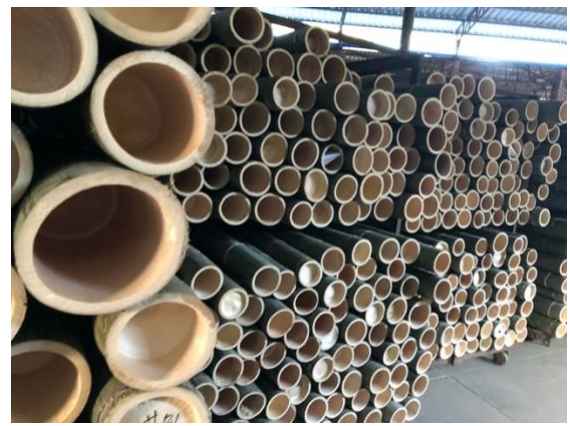
Figure 2 Bamboo culms and rough processing site near plantations

Semi-finished bamboo panels are made from sorted bamboo strips which are glued together. The top & bottom-layer-strips or Bamboo extreme™-material are in full length. The core (=> 20 mm thickness) is made with horizonal cross layer for maximum stability. Bamboo Panels can be used as decoration, walls, stairs, tabletops, furniture or similar. Produced from bamboo specie "Phyllostachus Pubescens", origin China.